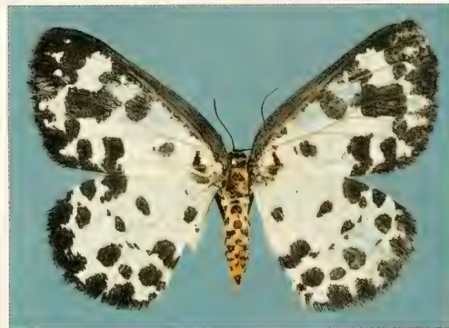
Fig. 10. Inouea colini , spec. nov., Paratype, ♀, Negros.